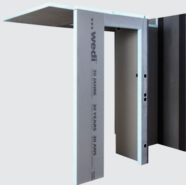
Bathroom component Front view