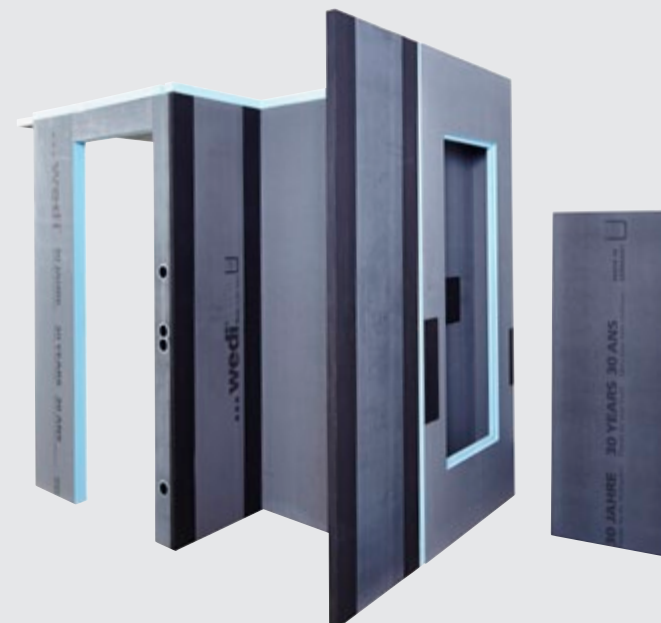
Bathroom component Lateral view